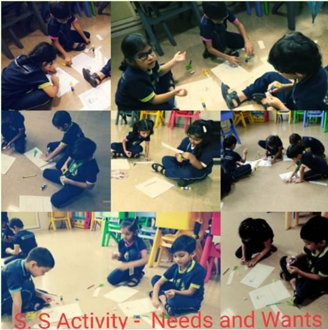
Needs and wants Compare and decide: